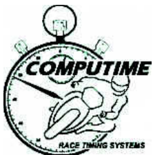
Clerk of Course - Tom Williams

Computime Race Timing Systems Pty Ltd © 1996-2008